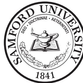
SEAL IN BLACK