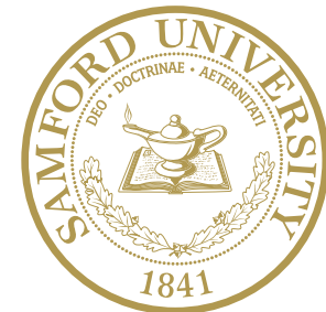
SEAL IN A METALLIC GOLD