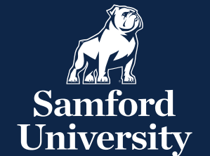
CROSSOVER VERTICAL ONE-COLOR (WHITE)