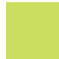
GARDEN GREEN PANTONE 584