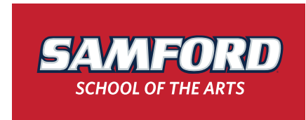
SCHOOL CROSSOVER FULL-COLOR