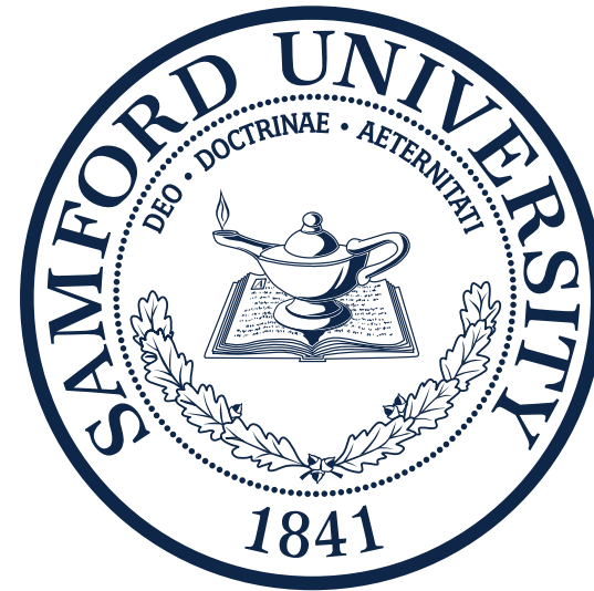
SEAL IN NAVY

The seal is not available for use without written permission from the Office of the President.