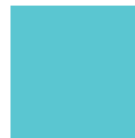
SKY BLUE PANTONE 325