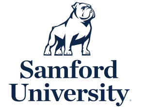
CROSSOVER VERTICAL ONE-COLOR (NAVY)