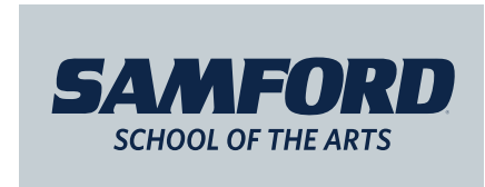
SCHOOL CROSSOVER ONE-COLOR (NAVY) (ON WHITE AND GRAY)