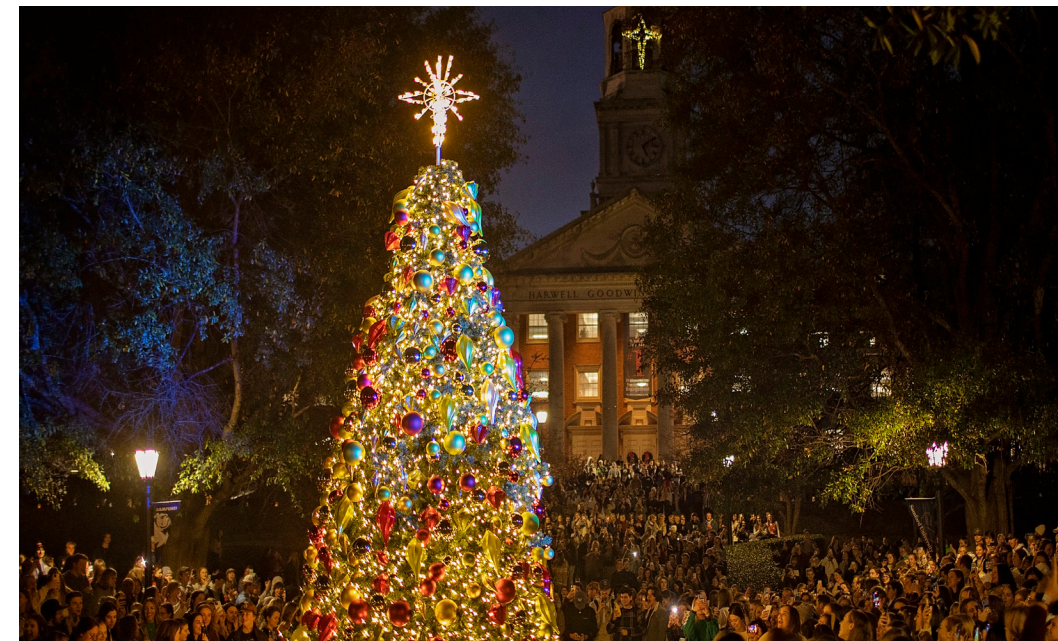
Students gather on Centennial Walk to celebrate Samford's annual Christmas tree lighting event, Lighting of the Way.

Samford offers you opportunities to grow as a leader and forge friendships that last. One of our most enduring traditions, Lighting of the Way, welcomes you into the heart of the Samford community during the Christmas season. Students, faculty and staff gather together for this annual event to celebrate the beginning of the Christmas season and the birth of Christ. From Lighting of the Way to professional organizations and club sports, you'll discover new passions, build new strengths and find Christ-centered community.